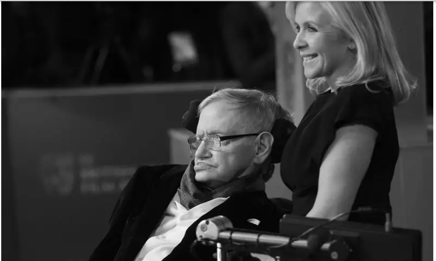
Stephen and Lucy Hawking